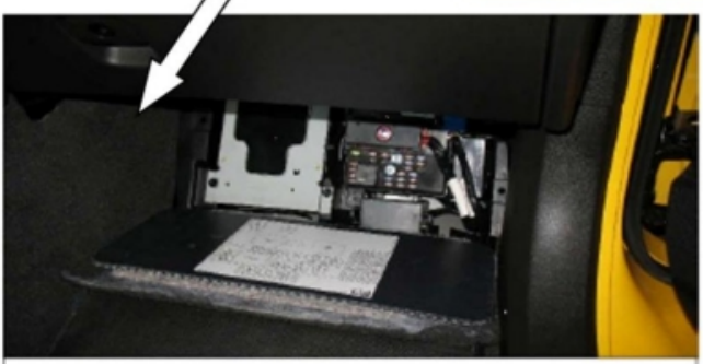
Pull down the floor board to access the fuse block