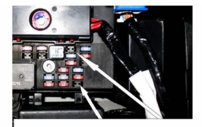
Remove the seat heater fuse and the exhaust fuse

Connect the black wire from the switch to the fuse tap using the BLUE butt connector.